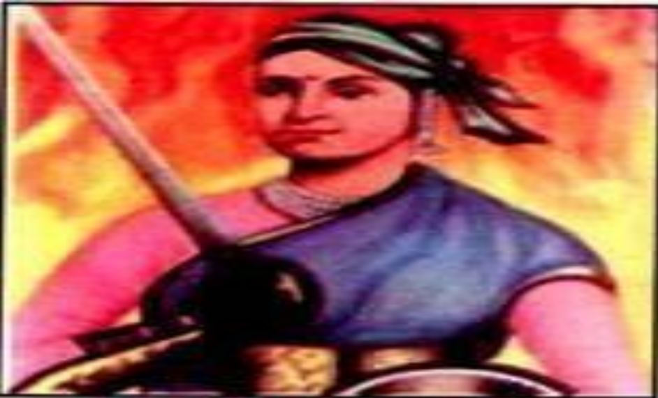
Rani Laxmi Bai