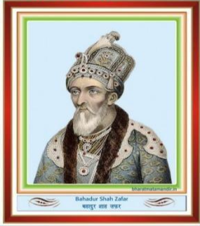
Bahadur Shah Zafar